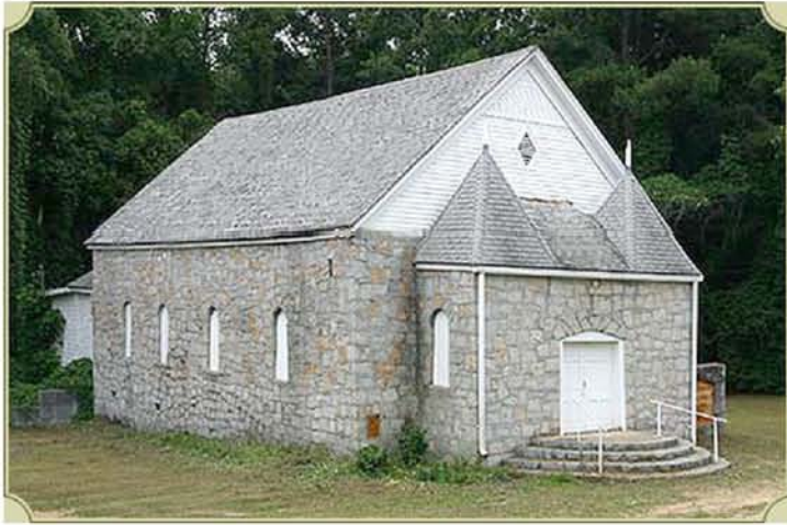
Bald Rock Baptist Church, Costley Mill Rd

The Good shall never lose God's blessing