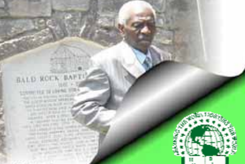
Old Bald Rock Rededication July 31 2011